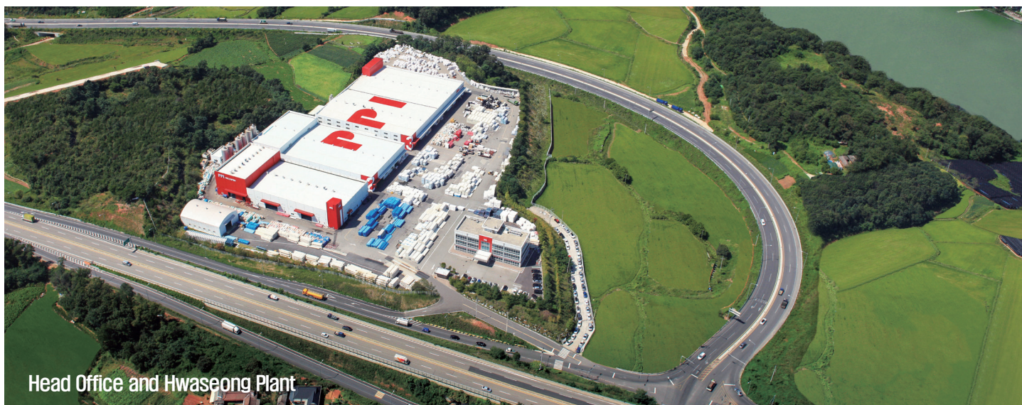
Head Office and Hwaseong Plant