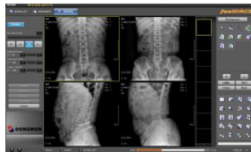
Image processing S/W